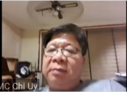
DMC Chi Uy